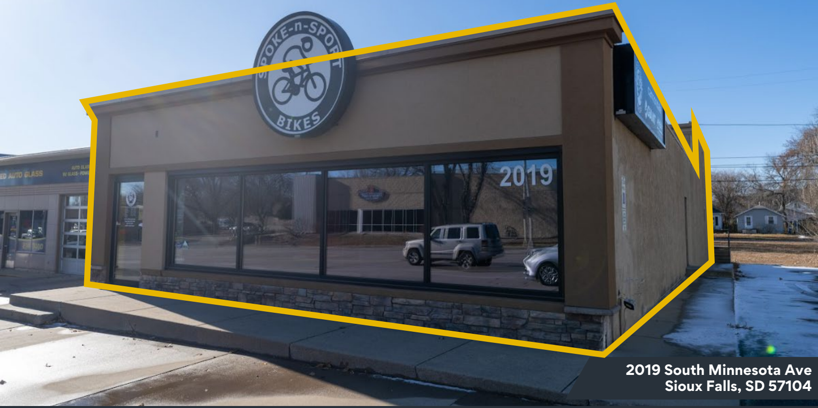
2019 South Minnesota Ave Sioux Falls, SD 7104