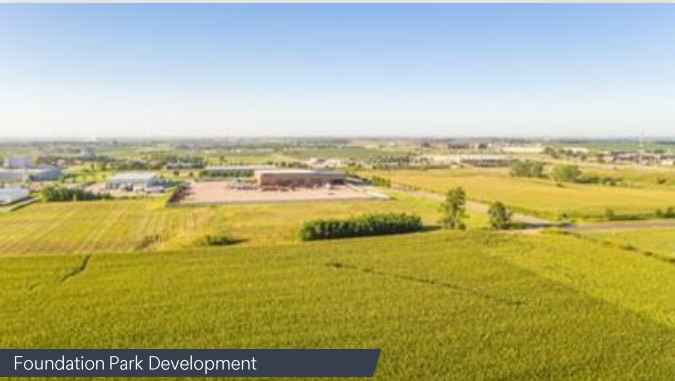
Foundation Park Development