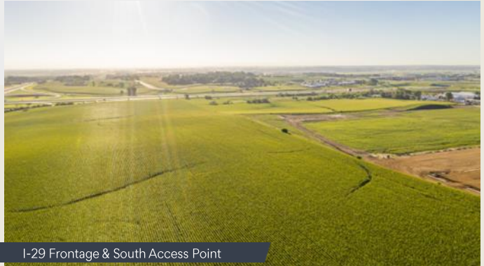
I-29 Frontage & South Access Point