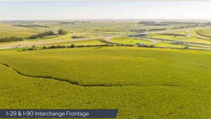
I-29 & I-90 Interchange Frontage