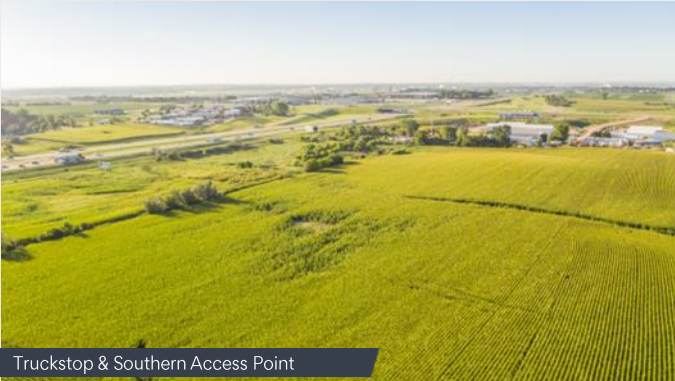
Truckstop & Southern Access Point