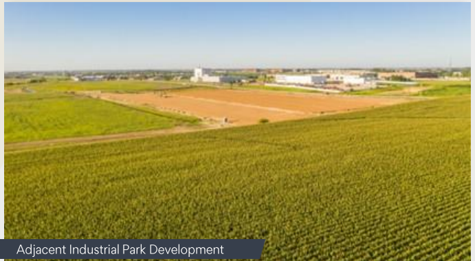
Adjacent Industrial Park Development