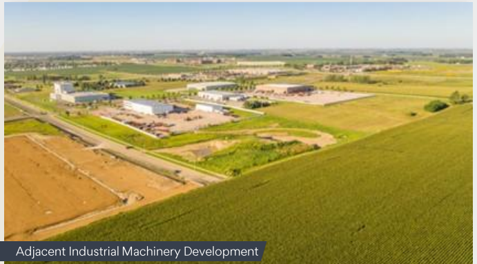
Adjacent Industrial Machinery Development