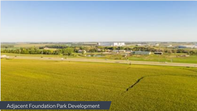
Adjacent Foundation Park Development